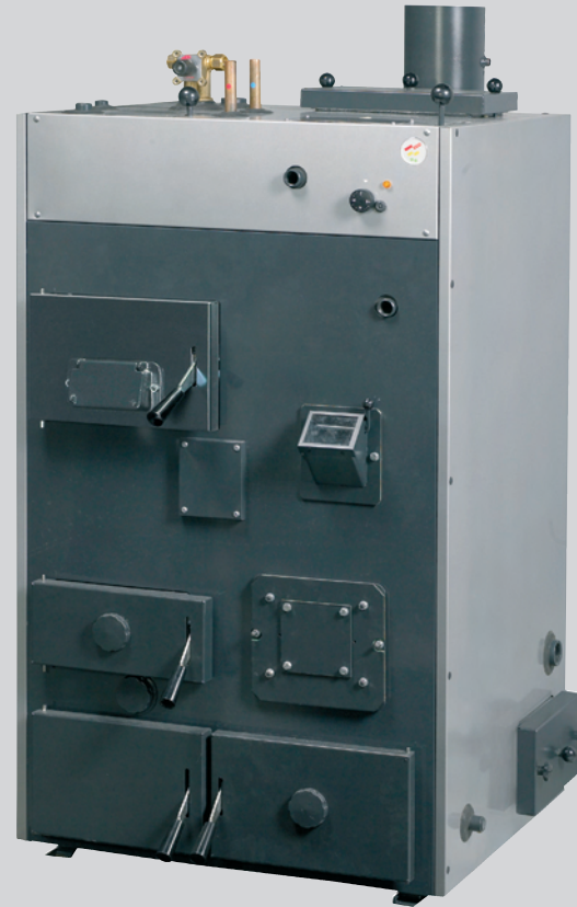
(Left) Ariterm Biomix 20 Additionally-equipped with BeQuem pellet burner.